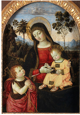
Pinturicchio, Virgin and Child with St John the Baptist, c.1490–5