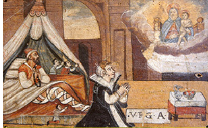
Sick man in bed prays with rosary, attended by wife and children , 16th century Il Museo degli ex voto del santuario di Madonna dell'Arco, Naples