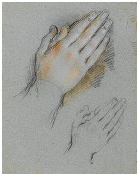
Follower of Federico Barocci, Studies of hands clasped in prayer , later 16th century