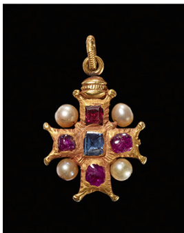
Jewelled cross pendant , c. 1510–30