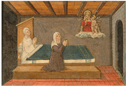
Woman with a rosary supplicates the Madonna of Lonigo on behalf of a sick woman , 1510 Madonna dei Miracoli, Museo degli ex voto, Lonigo