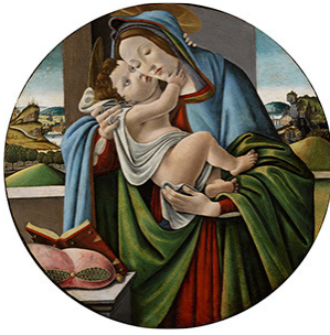
Studio of Sandro Botticelli, Virgin and Child, c. 1480–90