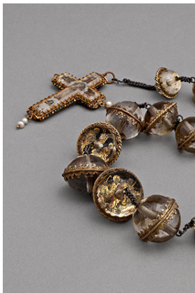
Rosary , 16th century Enamelled rock crystal beads mounted in silver gilt, length 38cm Palazzo Madama - Museo Civico d'Arte Antica, Turin. Reproduced by permission of the Fondazione Torino Musei. Image not to be duplicated without permission.