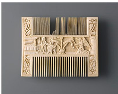
Comb with The Annunciation , c. 1450–1500 Kunstgewerbemuseum, Berlin